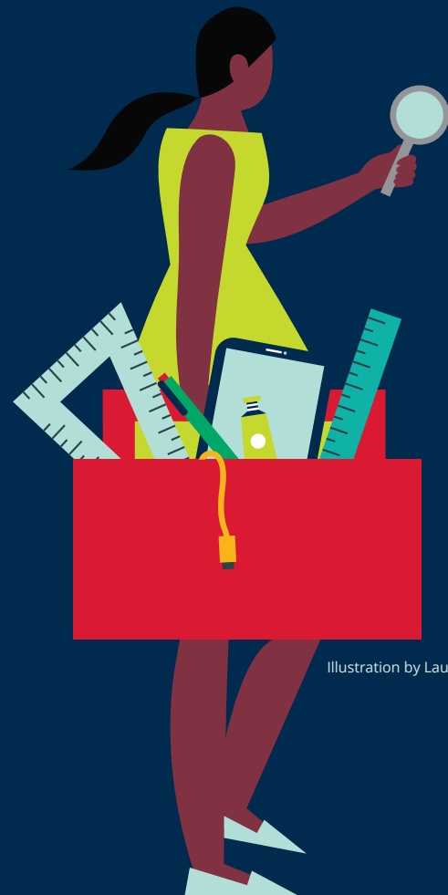
Illustration by Lauren Rolwing