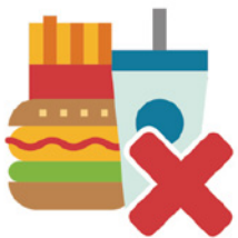
Eating / Drinking / Chewing gum