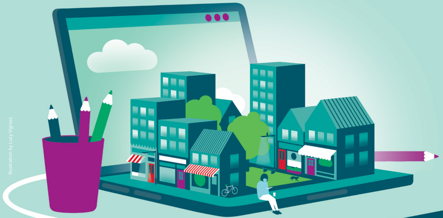
Illustration by Lucy Vigrass