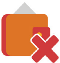
Wallets / Purses