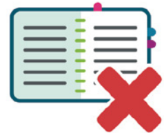
Books / Notes