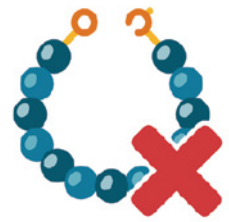
Jewellery thicker than ¼ inch (½ cm)