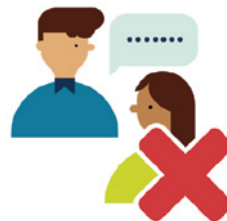
Chatting / Disturbing others